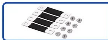
FREE BUS BARS AND GRUB SCREW&NUT