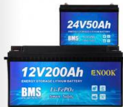
12V & 24V SERIES ENERGY STORAGE LITHIUM BATTERY