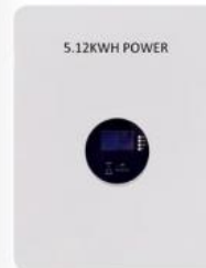
Solar LiFePO4 B5.12KW 51.2V 100Ah 200Ah atttery