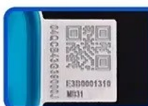
COMPLETE QR CODE