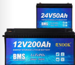
12V & 24V SERIES ENERGY STORAGE LITHIUM BATTERY