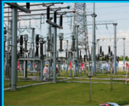
Power Station energy storage