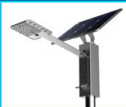
Solar Street Lighth