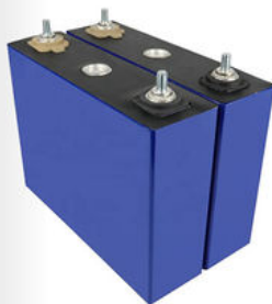
Lifepo4 battery 3.2V 304A