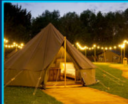
Household energy storage