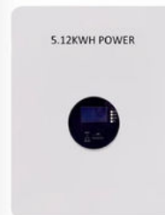
Solar LiFePO4 B5.12KW 51.2V 100Ah 200Ah atttery