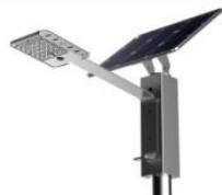
Solar Street Light