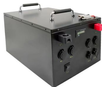
Energy storage lithium battery