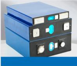
Automotive Grade Cells