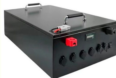
Energy storage lithium battery

for more products please visit us on enookbattery.com