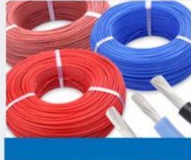
Pure copper flame retardant wire