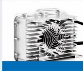
Lithium battery charger, waterproof IP65