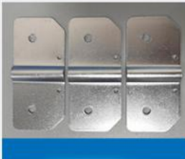
Low resistance connecting piece