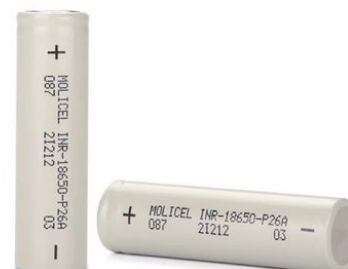
Original MoliceI P26A