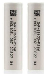
Original MoliceI P26A